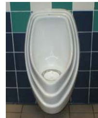
Figure 1. Typical Cartridge-Type Urinal.

Like ordinary urinals, waterless types are plumbed to a standard drain line, but obviously do not use a conventional water-filled trap. Waterless urinals utilize proprietary sealant liquids that act as a vapor trap. The liquids are composed primarily of natural oils that are lighter than water. Urine passes through this liquid and goes down the drain. The